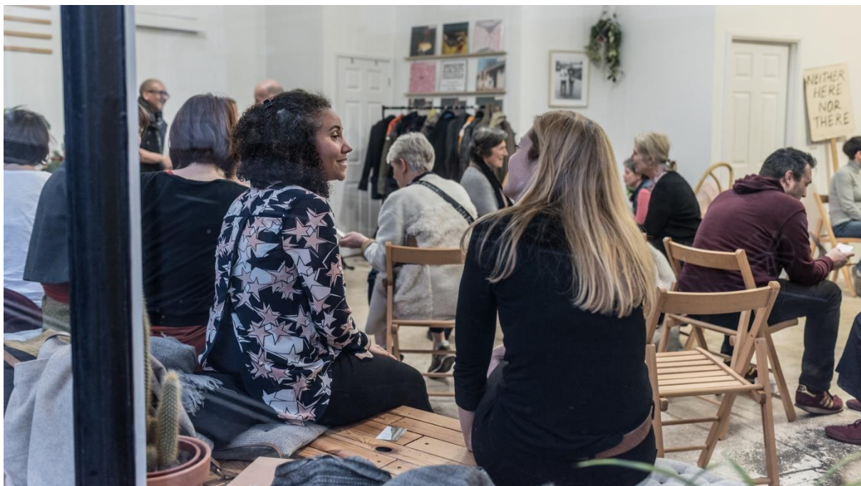
Neither Here Nor There at Scare the Horses, Exeter.